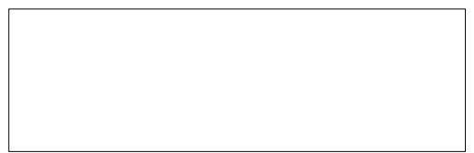
Pads D,E,& F (Looking Aft)